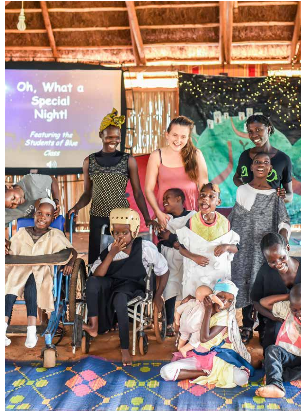
Blue Class at Ekisa Academy's annual Christmas nativity play.